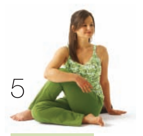
SEATED SPINAL TWIST As you twist, gently draw your left knee toward your right chest and resist the pull by pressing your knee into your hand.

of your right knee (Fig. 4). It's likely that your left sit bone is now lighter on the floor than your right. Lean onto your left sit bone to balance the weight between the two hips; this is the beginning of the stretch. Steady yourself by holding your left knee with your hands, and from this balanced foundation, inhale and lengthen upward through your spine. If the stretch is too intense or if you feel pain radiating down your leg, increase the height of the padding under your hips until the stretch is tolerable.