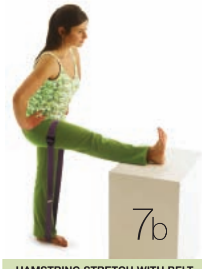
HAMSTRING STRETCH WITH BELT To help draw the left hip down in line with the right hip, loop a belt around the top of the right thigh and under the left foot.

In general, sciatic pain is helped by poses that passively stretch the hip with the thigh externally rotated, but not from poses such as baddha konasana (cobbler's pose) which actively rotate the thigh outward and thus tighten the deep hip rotators.