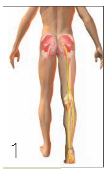
THE SCIATIC NERVE originates from the lower part of the spinal cord and runs between the buttock muscles all the way down your leg to your foot.

electric shocks down your sciatic nerve, and/or tingling, burning, weakness, or numbness in your legs or feet. These can be signs that an acute herniated disk is pinching the nerve, which is a bigger problem than sciatic pain alone.