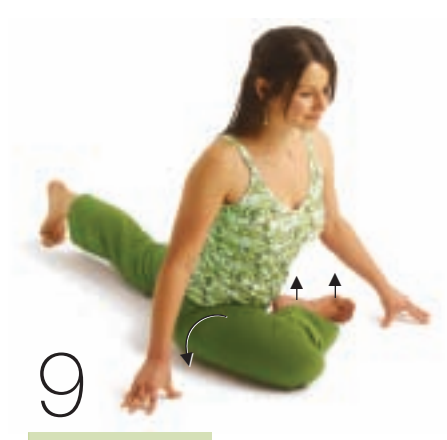
PIGEON POSE Move your right heel in line with your left hip, and your shin to a 45-degree angle. Keep your front foot engaged to protect the knee.

Raja kapotasana (king pigeon pose) is the strongest of the piriformis stretches. Bring yourself only to the edge of the stretch, so that you can remain there, breathe, and allow the piriformis to release. Start on your hands and knees. Bring your right knee forward and out to the right. Bring your right foot forward as well, until your heel is in line with your left hip and your shin is at about a 45 degree angle. Keep your foot flexed to protect your knee. To stretch the right piriformis, lean your upper body forward, tuck your left toes under, and slide or walk your left leg straight back, allowing your right thigh to rotate out passively as your hip descends toward the floor (Fig. 9). Keep your hips level to the floor and square to the front of the mat; don't let your pelvis turn or fall to one side. Support your right hip with a blanket if it does not reach the floor,