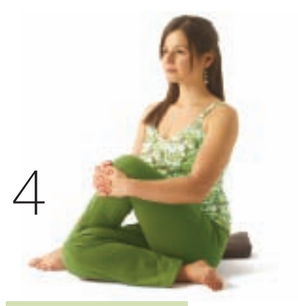
SEATED TWIST PREP With your right knee pointing forward and your left foot in line with your right hip, lean slightly to your left. This will distribute your weight equally onto both sit bones.