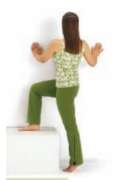
and, using the wall for balance, lift your left heel off the floor. As you exhale, lower your heel to the floor and allow your right hip to fall in line with your left hip.