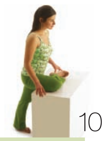
STANDING PIGEON POSE Keep your hips level and square to the front of the room as you draw your navel toward your bent leg.

and remain in the pose for anywhere from several breaths to a minute. Experiment with leaning your upper body forward over your shin, and with bringing your torso more upright to vary the stretch to the hip.