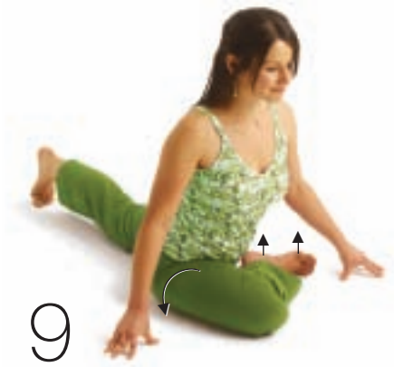
PIGEON POSE Move your right heel in line with your left hip, and your shin to a 45-degree angle. Keep your front foot engaged to protect the knee.

Raja kapotasana (king pigeon pose) is the strongest of the piriformis stretches. Bring yourself only to the edge of the stretch, so that you can remain there, breathe, and allow the piriformis to release. Start on your hands and knees. Bring your right knee forward and out to the right. Bring your right foot forward as well, until your heel is in line with your left hip and your shin is at about a 45-degree angle. Keep your foot flexed to protect your knee. To stretch the right piriformis, lean your upper body forward, tuck your left toes under, and slide or walk your left leg straight back, allowing your right thigh to rotate out passively as your hip descends toward the floor ( Fig. 9 ). Keep your hips level to the floor and square to the front of the mat; don't let your pelvis turn or fall to one side. Support your right hip with a blanket if it does not reach the floor,