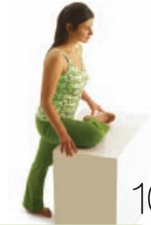
STANDING PIGEON POSE Keep your hips level and square to the front of the room as you draw your navel toward your bent leg.

and remain in the pose for anywhere from several breaths to a minute. Experiment with leaning your upper body forward over your shin, and with bringing your torso more upright to vary the stretch to the hip.