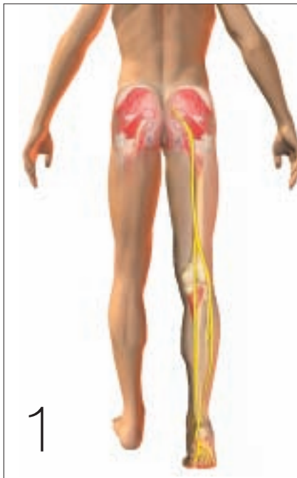
1 THE SCIATIC NERVE originates from the lower part of the spinal cord and runs between the buttock muscles all the way down your leg to your foot.

electric shocks down your sciatic nerve, and/or tingling, burning, weakness, or numbness in your legs or feet. These can be signs that an acute herniated disk is pinching the nerve, which is a bigger problem than sciatic pain alone.